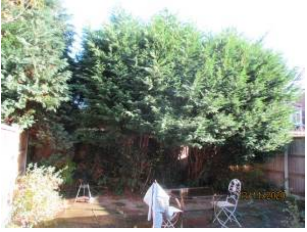
Rear boundary of the site