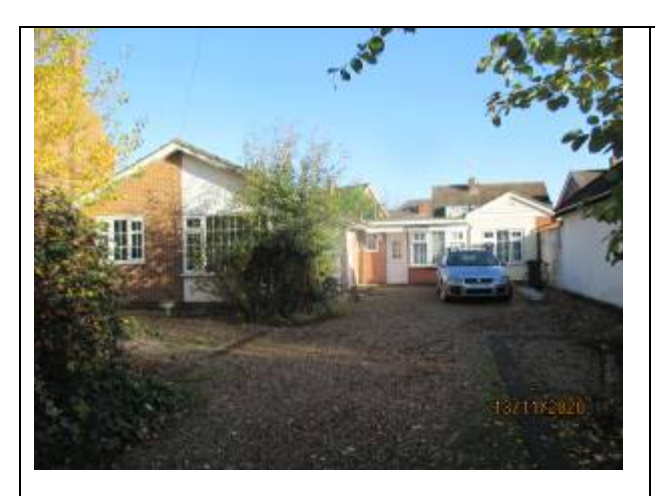
Front elevation of 28 Park Road. The self-contained annexe is to the right.