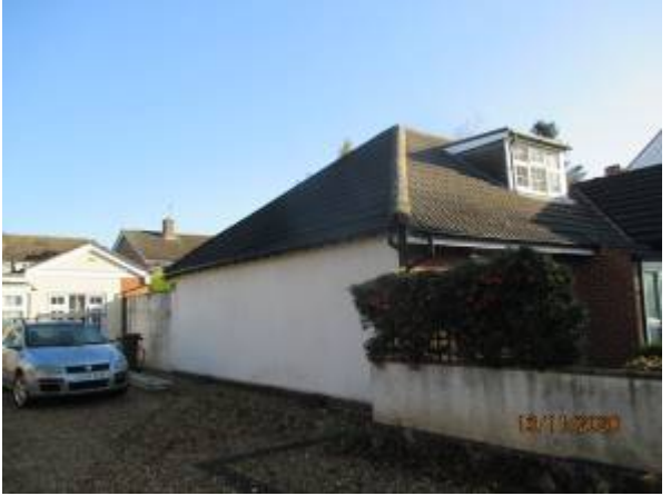
Side elevation of 26 Park Road