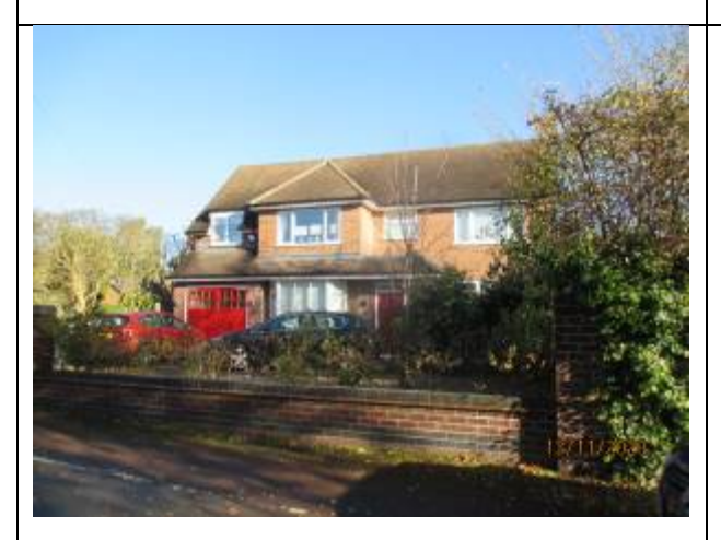
Front elevation of 34 Park Road