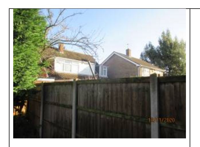
Rear elevation of 2 Rookwood Close