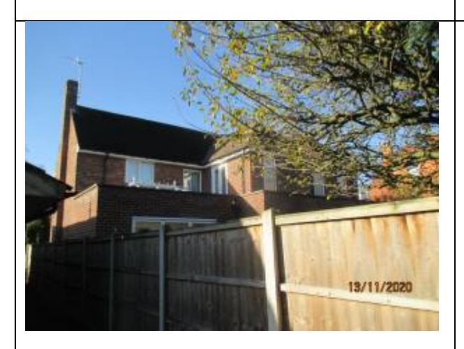
Rear elevation of 34 Park Road