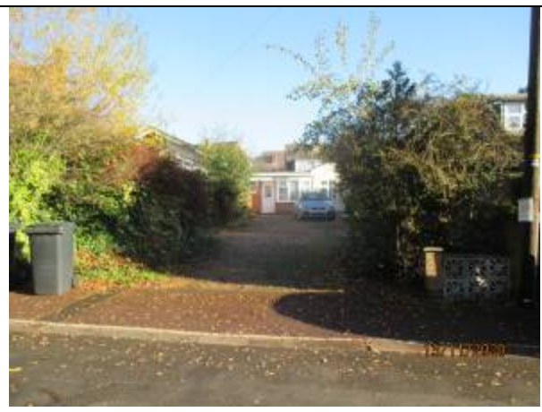
View of existing access off Park Road